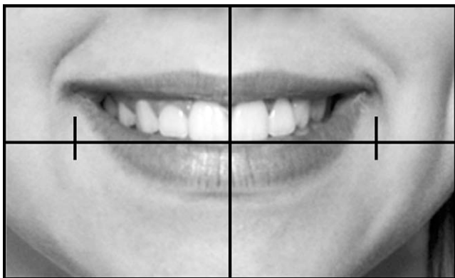
Figure 1. A standardized smile image using the 3-in \times 5-in template.

of this sample size with respect to correlation tests (Type I error = 0.05). For a bivariate normal distribution and a sample size of 48, a test of H_0: P = 0 (ie, the correlation coefficient under the null hypothesis) was found to have a power of 0.80 to detect a linear correlation of r = 0.38 . Thus, the default sample size for the Q-sort procedure was deemed adequate for purposes of testing for correlation.